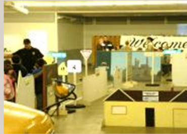
PREVIOUS SAFETY CITY

It is hoped Safety City will continue to grow in the future and include other safety opportunities, the proper wearing of bicycle helmets, education on seatbelts/booster seats, and skateboard safety.